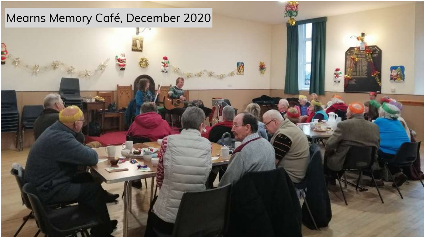
Mearns Memory Café, December 2020