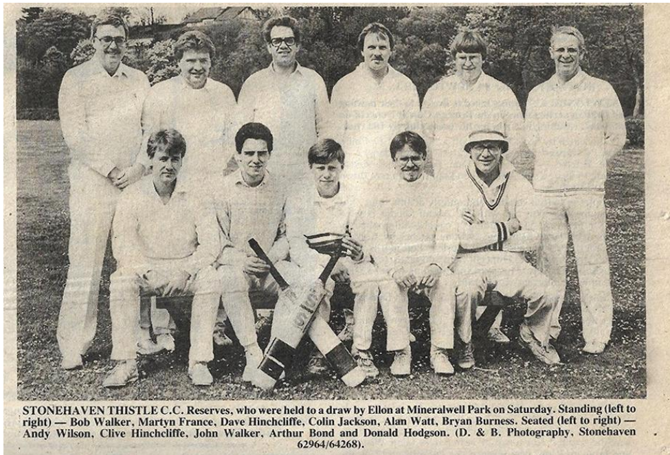
Stonehaven Thistle Cricket Club, 1987. The club will celebrate its 150th anniversary next year.