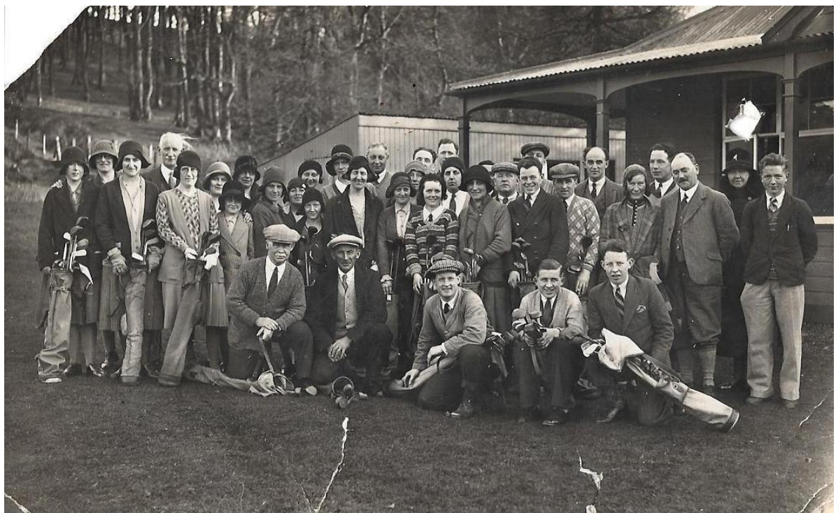
A group of golfers at Laurencekirk Golf Club, circa 1920s. The course was situated on the Garvock hill.